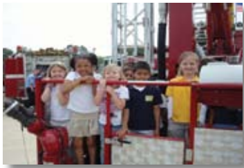
Pearl Fire Department Station 1